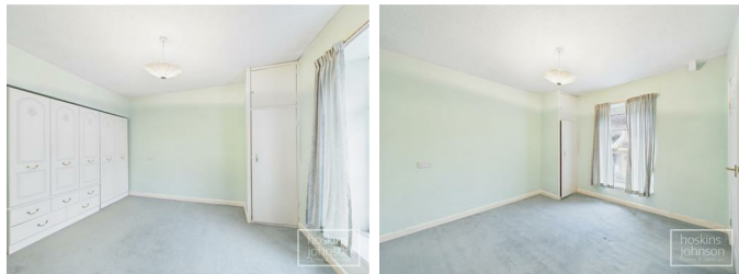
Bedroom 2 11'3" x 10'4" (3.43 x 3.15)

Double glazed window to rear, radiator, airing cupboard.